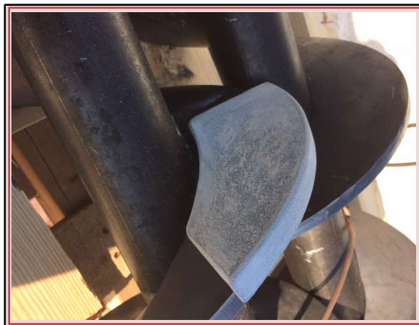
Custom Screw Conveyor Flight Plate Installed with SCProbond™ epoxy

-Limestone Mine Operator and Returning SCP Customer